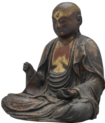
Ksitigarbha Bodhisattva, Kamakura period (1192–1333), 13th century, Japan. Lacquered and gilded wood with semi-precious stone; 8 ¼ x 7 x 6 1/8 in. (20.9 x 17.8 x 15.6 cm). Gift of J. G. Phelps Stokes